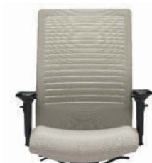
Desert (MT20) Desert Sand (VU11)