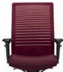
Burgundy (MT29) Red Rose (VU18)