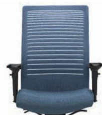
Arctic (MT33) Arctic Blue (VU14)