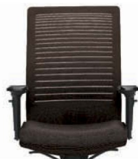
Chocolate (MT28) Chocolate Fountain (VU13)