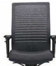
Quarry (MT31) Quarry Grey (VU15)