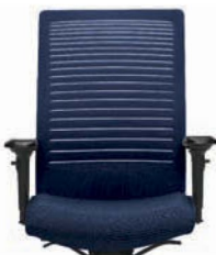
Wave (MT26) Tidal Wave (VU16)