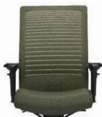
Moss (MT22) Ivy Moss (VU17)