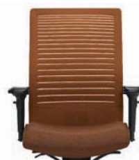
Sunset (MT24) Orange Sunset (VU12)