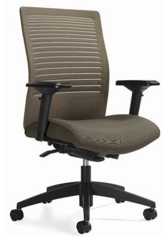
2662-8 Medium Back with weight sensing mechanism. Shown in Sand (MT21) and Vue Mesh, Sandy Beach (VU10).