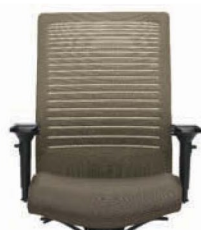
Sand (MT21) Sandy Beach (VU10)