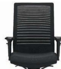
Black (MT32) Coal Black (VU19)