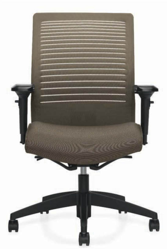
2662-8 Medium Back with weight sensing mechanism. Shown in Sand (MT21) and Vue Mesh, Sandy Beach (VU10).

applied exactly where you need it. Vue Mesh is available in a choice of 10 colors with coordinating Match fabric for the seat. Loover can also be upholstered in your choice of many fabrics and leathers.