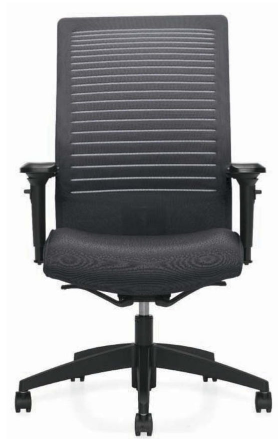
2661-8 High Back with weight sensing mechanism. Shown in Match, Quarry (MT31) and Vue Mesh, Quarry Grey (VU15).