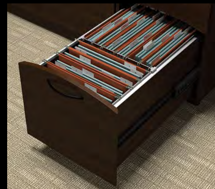
PEDESTALS ARE UNIVERSAL FOR RIGHT OR LEFT OR RIGHT CONFIGURATIONS AND DRAWER FRONTS ARE PREDRILLED FOR OPTIONAL HANDLES, AS SHOWN.