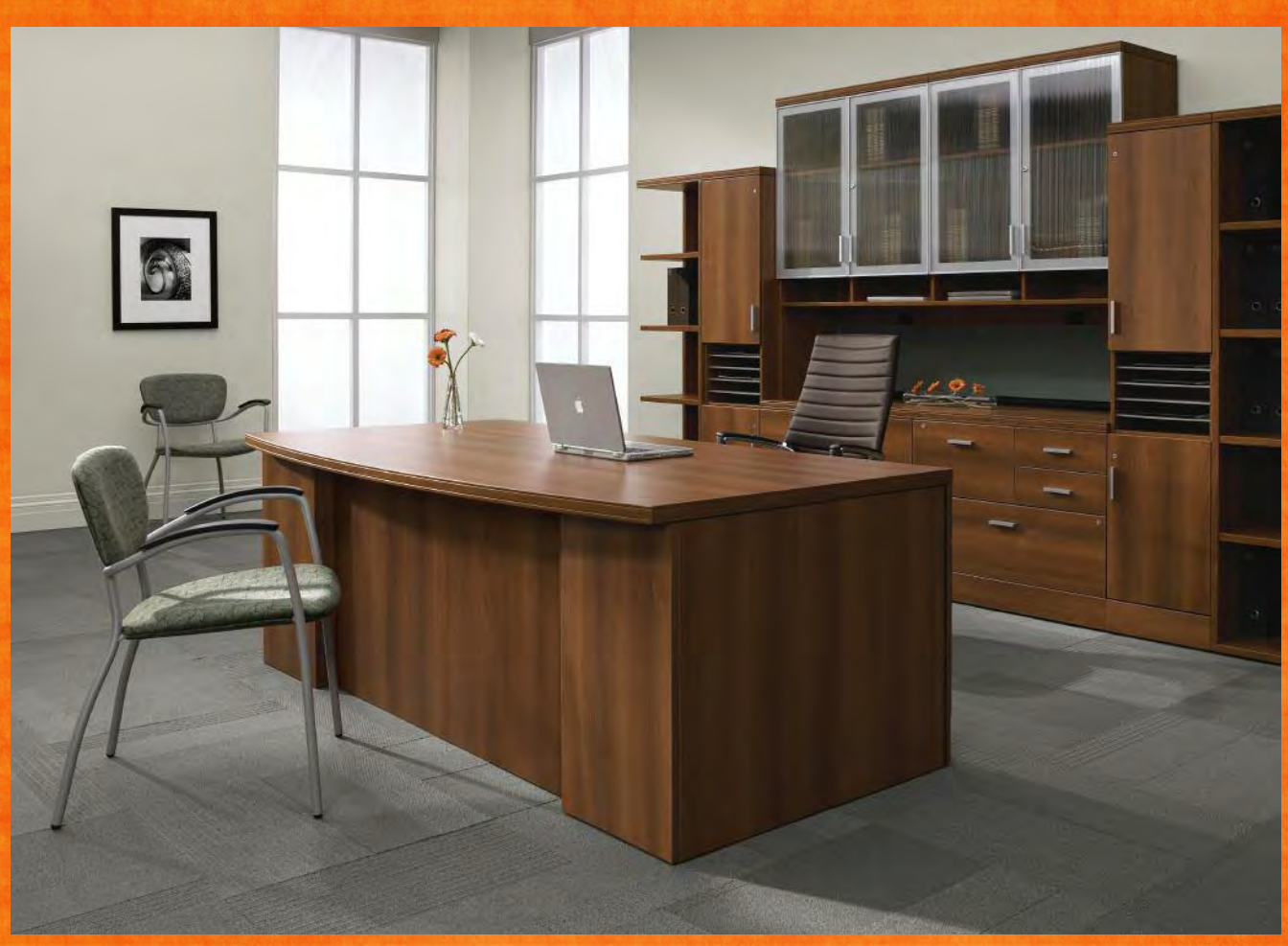
Zira shown above in Avant Honey (AWH) with Global Accord seating in Contract Leather, Dark Brown (D531) and Caprice in Mayer Jumpin' Jacks, Aquamarine (YF47). The Bicut Edge has a subtle transitional flair and is available in 1" or 1½" top thickness.