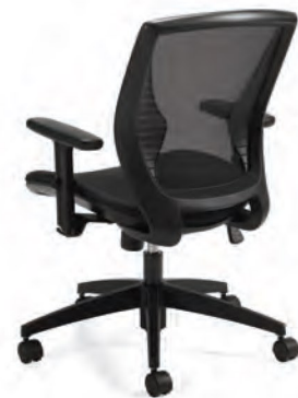
Shown in Black Mesh