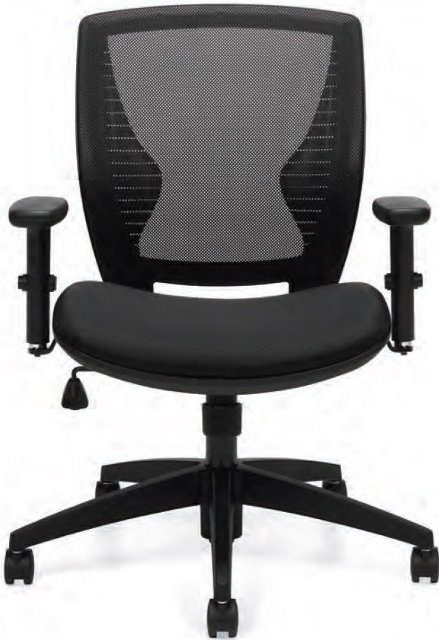
Shown in Black Mesh