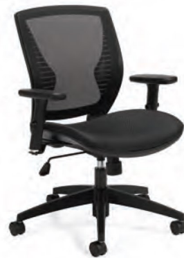
Shown in Black Mesh