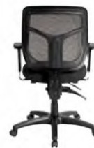
black mesh PM01