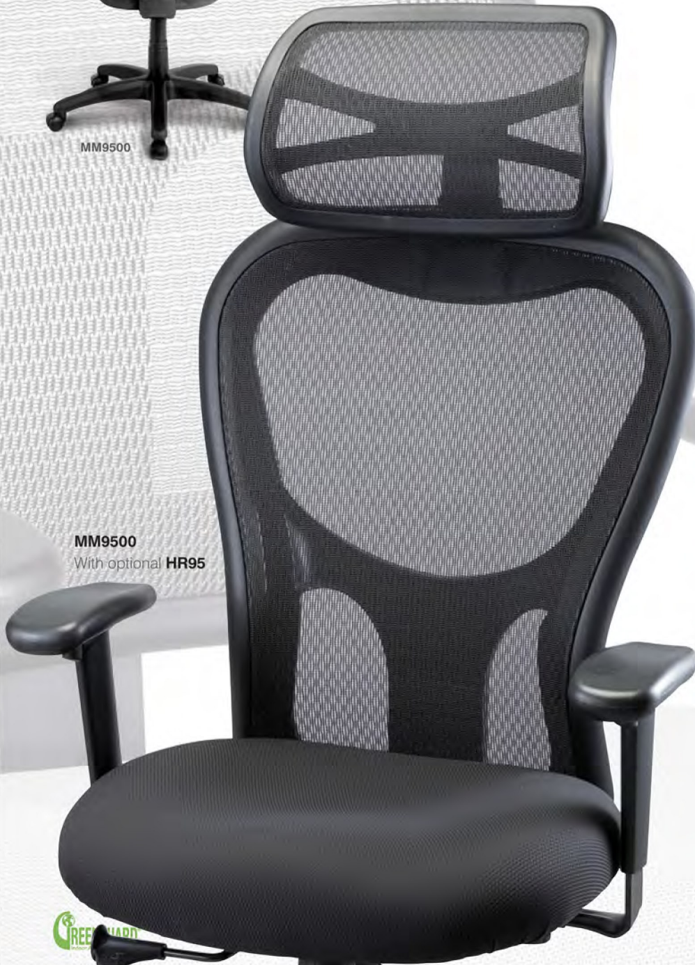
MM9500 With optional HR95