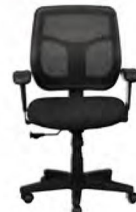
black fabric 5806