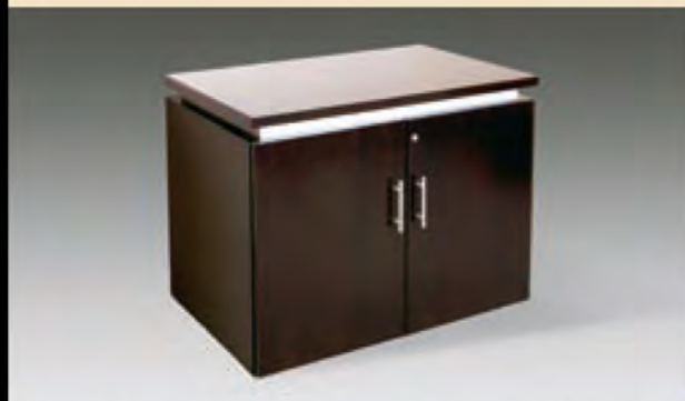
A WIDE SELECTION OF STORAGE OPTIONS PROVIDE ATTRACTIVE AND USEFUL ADDITIONS TO ANY CONFERENCE ROOM.