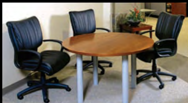
ECLIPSE CONFERENCE TABLES ARE ALSO AVAILABLE IN A CHOICE OF ROUND SURFACES FOR SMALL TEAM AREAS OR PRIVATE OFFICES.