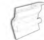
Modesty Panel with Wire Management