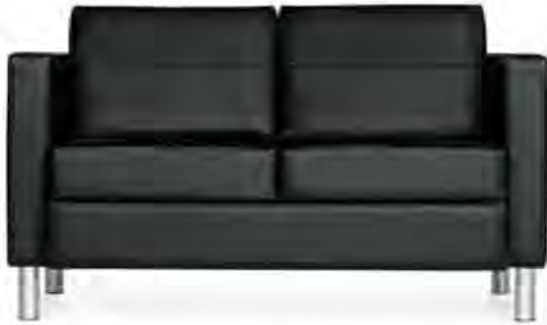
7876 Two Seater Sofa with Leather/Mock leather combination (477/577) Graphite