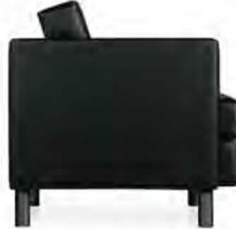
Note: Legs are available in either Tungsten or Black Finishes

CITI offers a contemporary timeless look that fits anywhere, it is finely scaled - just 31" deep and 30" wide for the club chair, 50.5" wide for the two seater and 72" wide for the three seater. - so it works particularly well where space is at a premium or where a lighter scale presence is desired. The raised leg enhances the lightness of scale and provides easy access for cleaners. CITI is finished beautifully in Italian Leather or Leather/Mock Leather combinations. Cushions are sewn with double-needle-stitched seams and sits high and firm, making it extremely appropriate as reception area or office seating.