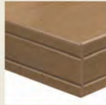
1 ½" with bicut edge (CR)