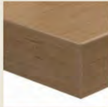
1 ½" with 3mm edge (C3)