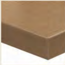
1" with 3mm edge (A3)