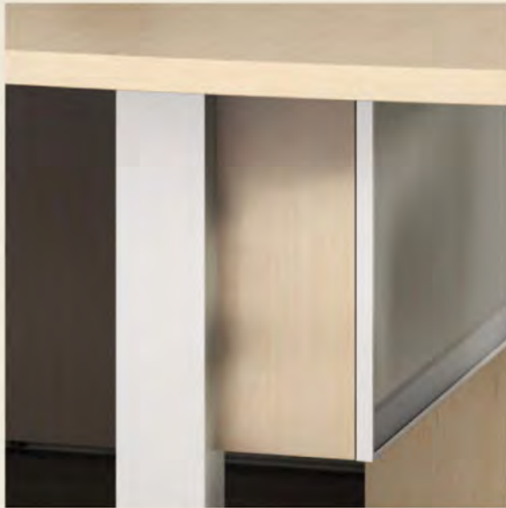
4" square monopost are available in Silver or Black finish. Optional 4" and 5" round are available at no extra charge.

Zira™ is the most functional solution to your work environment efficiency and organization.