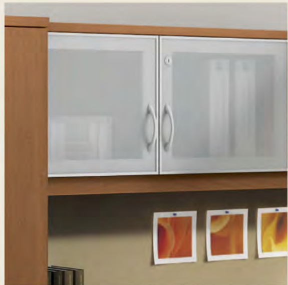
Hutch with glazed doors are available in 4 glazing options with Silver or Black frames. 9 handle options in Silver, Black, Nickel or Brass finishes.