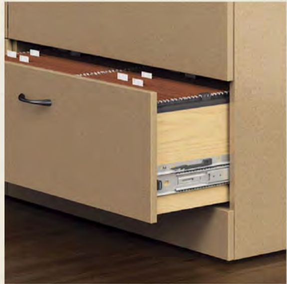
Box drawers are mounted on ¾ extension ball bearing slides.