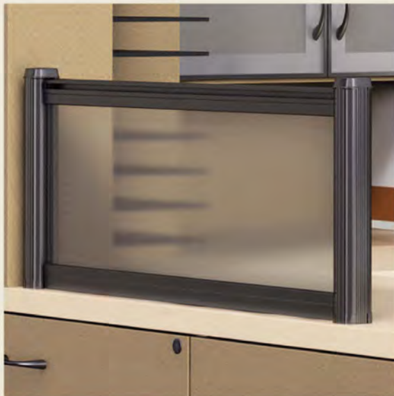
Divide™ a modular desk-mounted panel system shown with glazed panels which vertically stack to provide privacy.