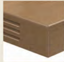
1 ½" with fluted edge (CF)