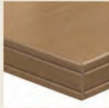
1" with bicut edge (AR)