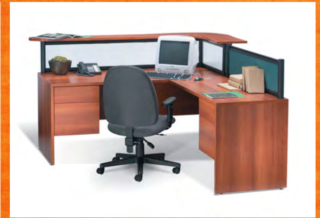
Cover Shot: DIVIDE shown with Correlation components finished in Avant Cherry over Black. DIVIDE Panels are finished in Garrison GA01 Bamboo fabric with glazed inserts. Seating: Azeo upholstered in Garrison GA07 Charcoal.