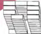
QuadSlider System (Q632LT8 shown) Storage Capacity - 2,520 LFI* Footprint - 43 Square Feet

*Linear Filing Inch capacities shown are based on letter-sized folders for 8-high, 36" wide units. Actual filing inches are based on type of media, width and height of ThinStak® units and available floor space. Contact your Datum representative for different configurations based on your filing needs.