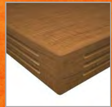
1 ½" with fluted edge (CF)