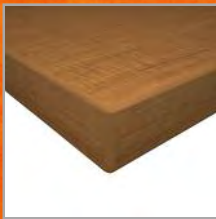
1" with 3mm edge (A3)