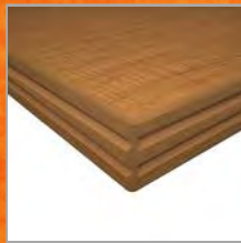
1" with bicut edge (AR)