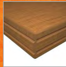
1 ½" with bicut edge (CR)