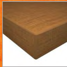
1 ½" with 3mm edge (C3)