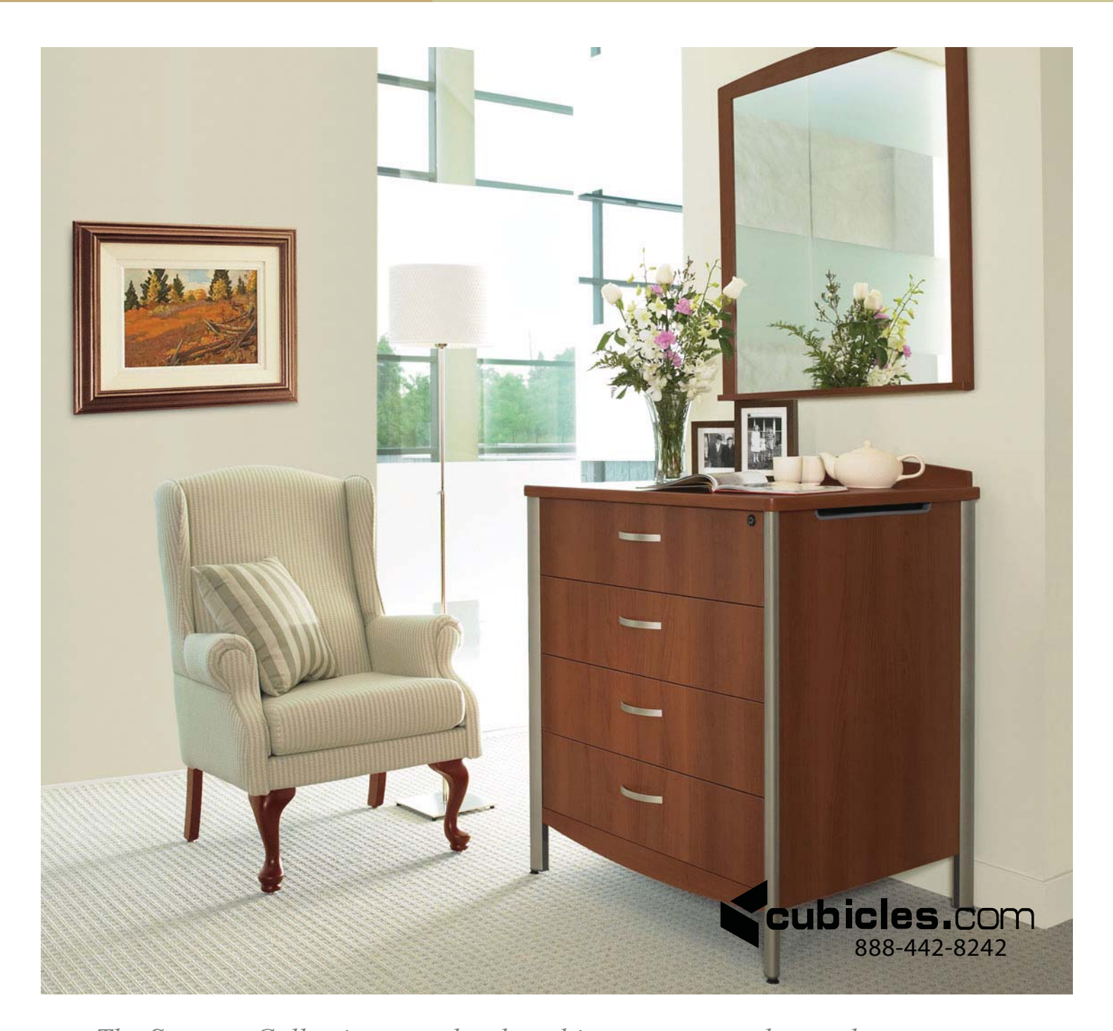
The Sonoma Collection was developed in response to the needs of care givers and changing expectations of people in care.

Sonoma Dressers are available in both three and four drawer configurations and at two depths to accommodate the room dimensions and geometry. Drawers move easily and close securely on high quality suspensions that extend up to 80 percent for easy access. Handles provide gentle contours and generous hand clearance to accommodate people with reduced vision or limited motility. Hutch bookcases are available in two heights as well as stand alone bookcases with one or more adjustable shelves for flexibility and structural integrity.