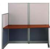
Straight Office Cubical 63"H x 64½"W x 32¼"D