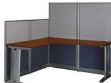
L-Office Cubical 63"H x 64½"W x 64½"D