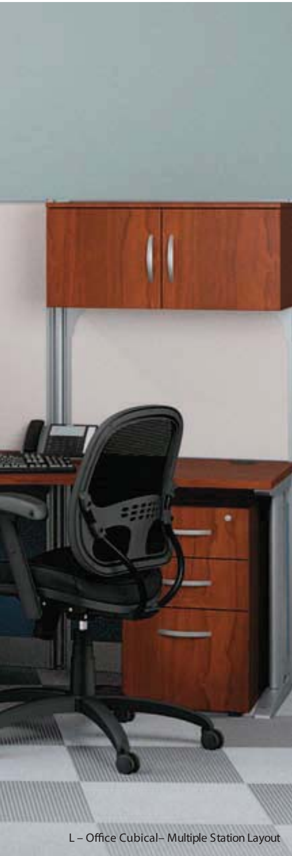
L - Office Cubical- Multiple Station Layout