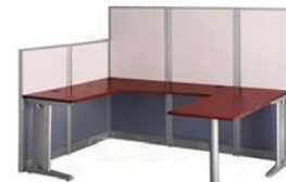
U-Office Cubical 63"H x 88¼"W x 64½"D