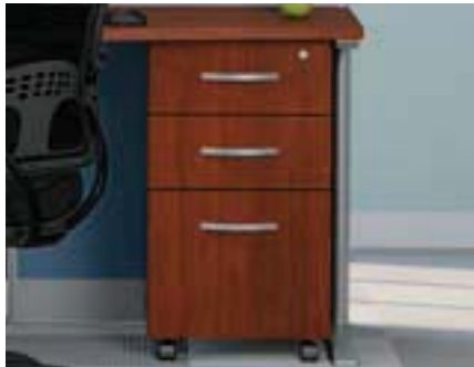
File (Ships Pre-Assembled)