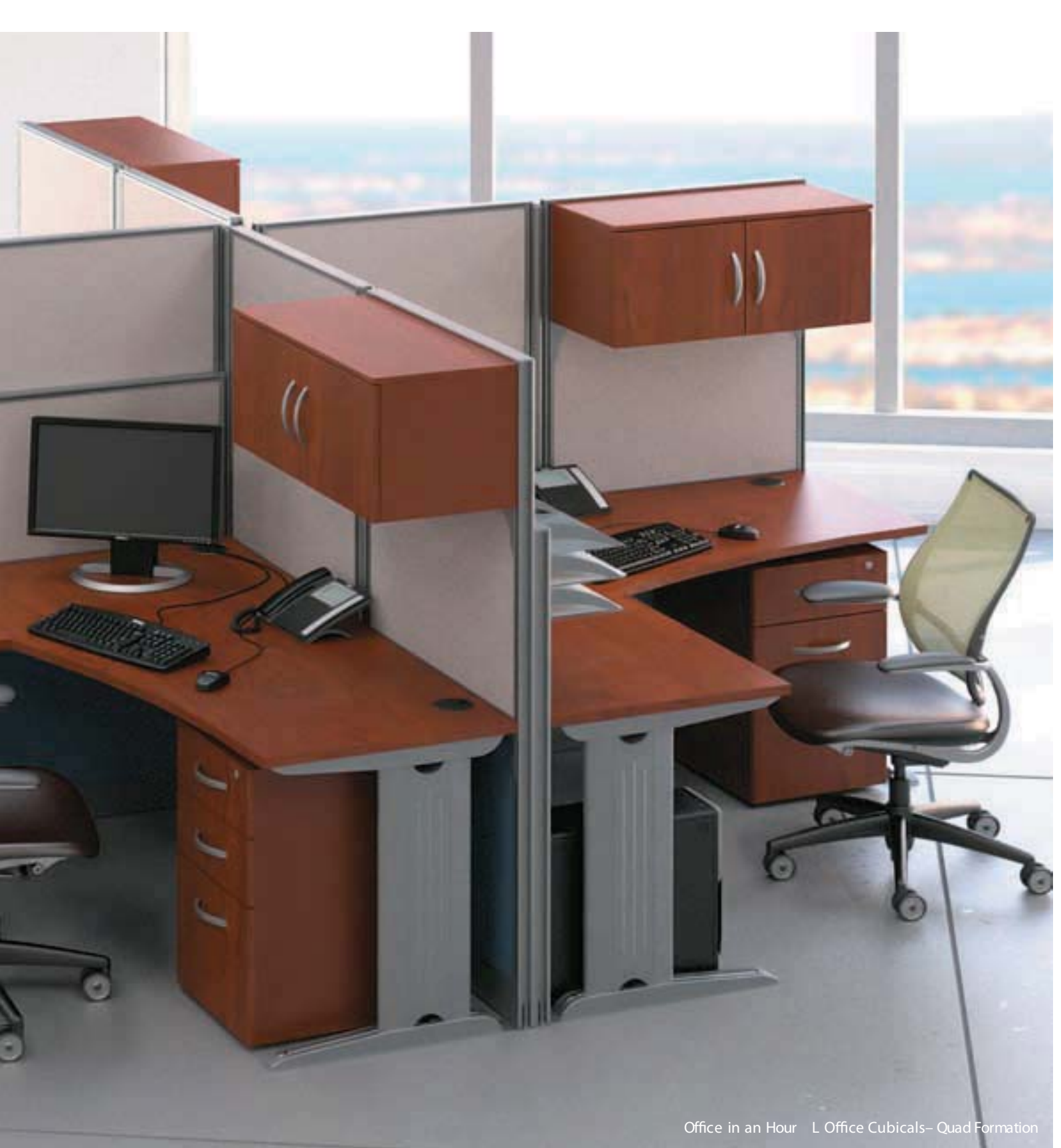
Office in an Hour L Office Cubicals- Quad Formation