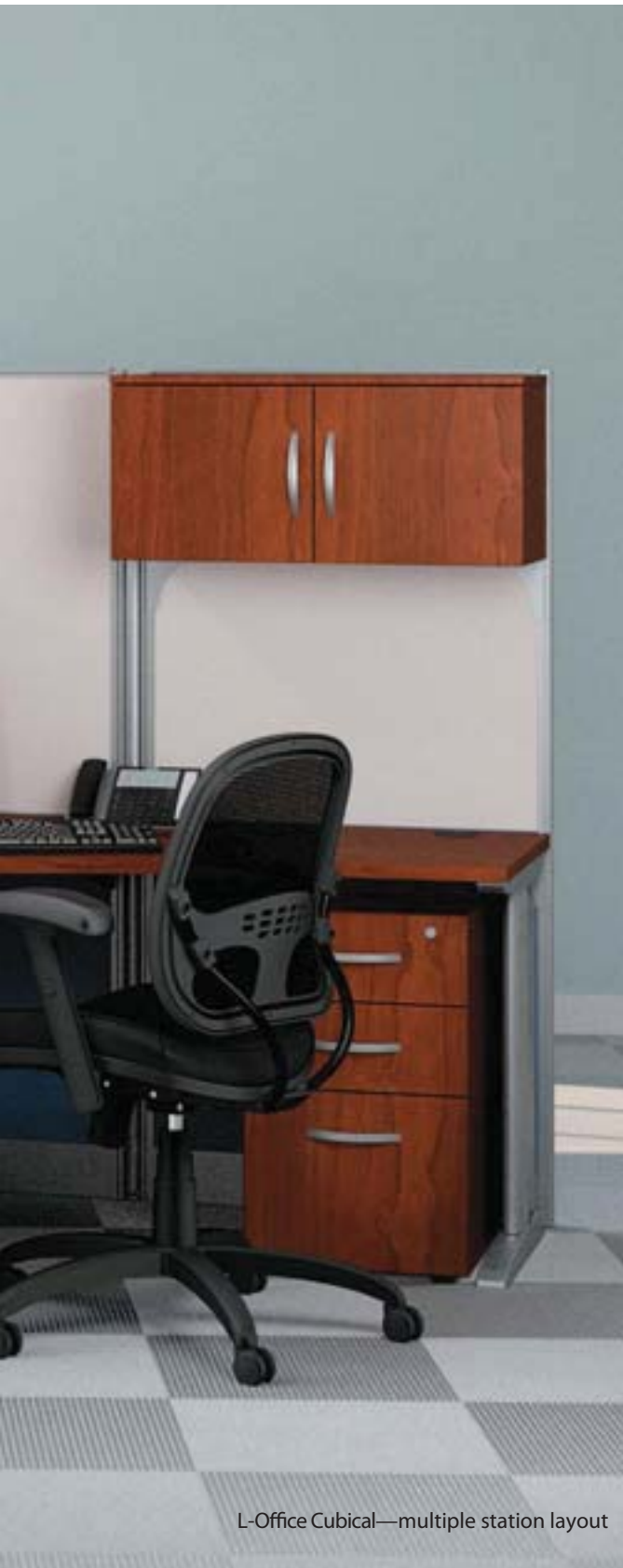
L-Office Cubical—multiple station layout