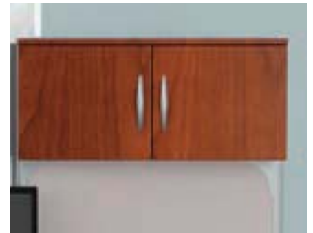
Cabinet (Ships Pre-Assembled)