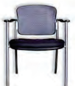
3119 Guest Chair