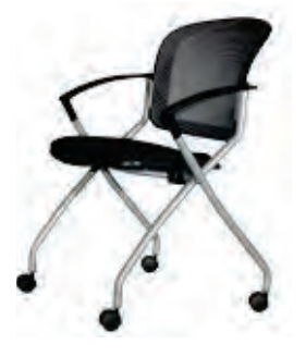
3159 Nesting Chair