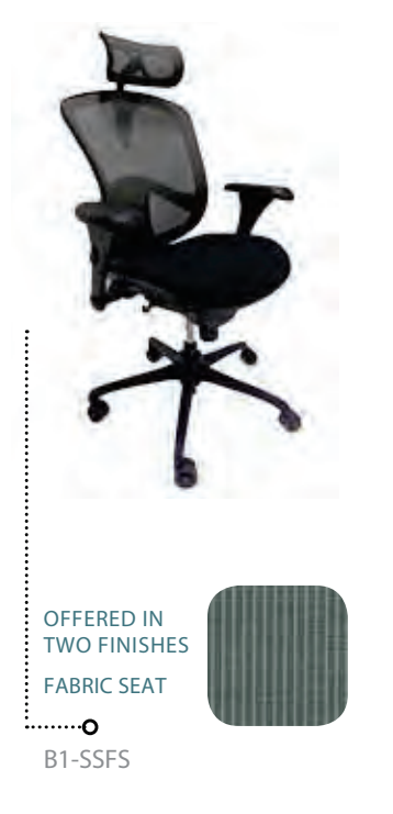
C2 : Executive Guest