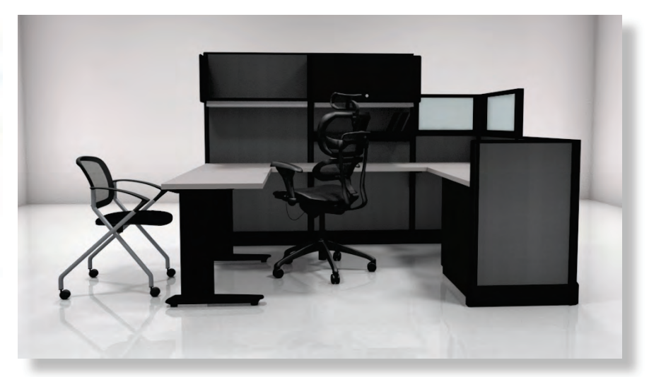
Finishes Shown: Fabric : Grey Sky / Filpper Door : Painted BU Work Surface : Folkstone Grey / Trim, Base & Edge : BU