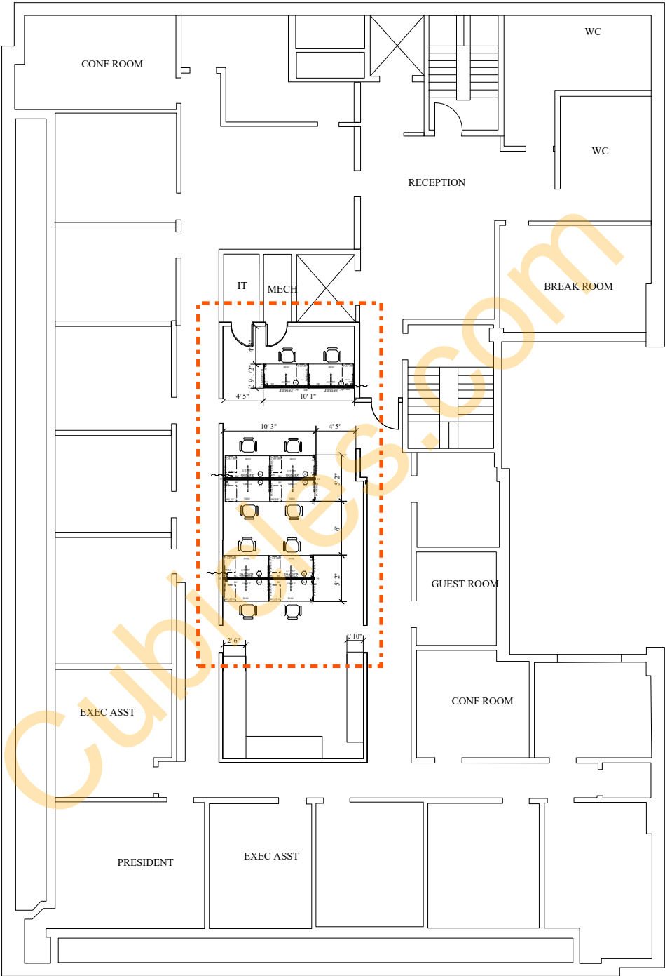
2D OVERALL LAYOUT