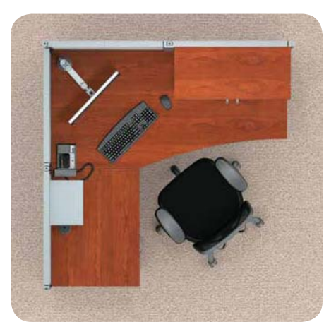
Layouts as compact as 6' x 6'