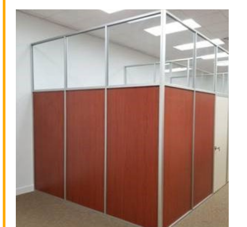
FRAME FINISH - ANODIZED SILVER