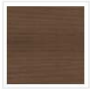
Modern Walnut Stock