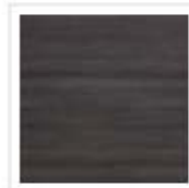
Coastal Gray Stock