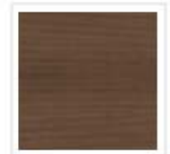
Modern Walnu Stock