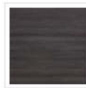
Coastal Gray Stock