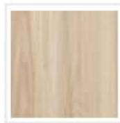
American Elm Stock