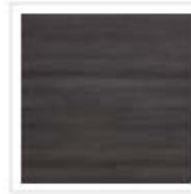
Coastal Gray Stock