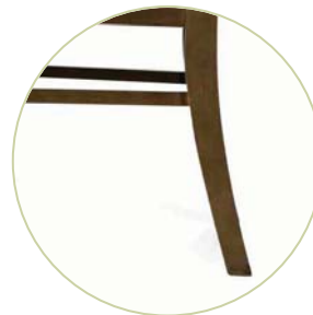
Phoenix gracefully curved back leg.