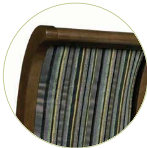
Phoenix rolled wood top rail.

Product shown in Mayer Fathom, WC763006 Lava Flow back and Mayer Phoenix, PH010 Mocha seat with CJM Charcoal Java finish.