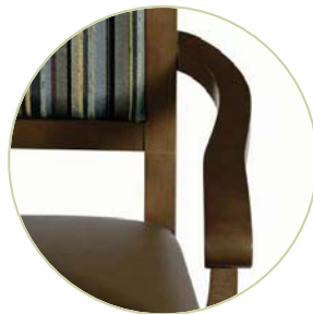
Phoenix armrest with accentuated curve and grip extension.