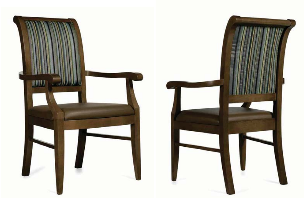
GC4164 Phoenix wood armchair.

Simple yet elegant, The phoenix hospital chair series combines straight lines and curves to create a beautiful, clean-looking armchair. Featuring a distinctive rolled wood top rail on the chair back. Phoenix's elegance is further enhanced by beautifully accentuated curves on the armrests and legs. The extended armrests help users to firmly grip the chair when exiting.