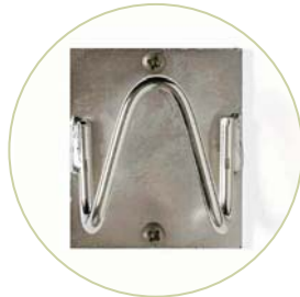
Wall Mounting Bracket - Optional wall bracket allows chairs to be conveniently stored while not in use.