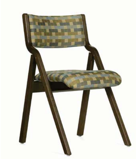
GC7609 Janna folding chair with upholstered seat and back.