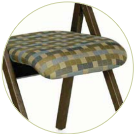
Ultracell foam seat cushion is standard.

Above (and Cover) : all products shown in Mayer, Razzamatazz Aqua (WC782-014), frame finish in Cocoa Vanilla (CVM).