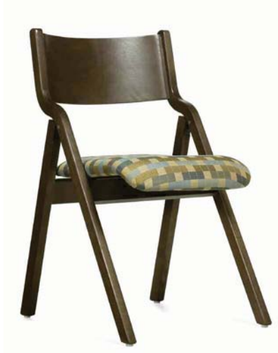
GC7611 Janna folding chair with upholstered seat and wood back.

GLOBALcare has developed a new series of all purpose hospital chair that is ideal for any healthcare setting. Janna's unique folding frame is the perfect solution for temporary seating, especially where space is at a premium. Janna medical chairs are ideal for resident/patient rooms, guest seating, dining rooms, waiting rooms and lobbies,