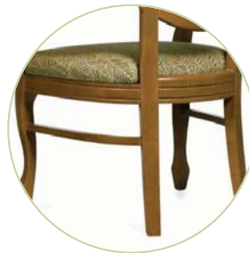
Savannah leg support bars.