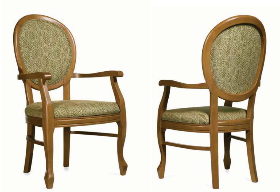
GC4161 Savannah armchair.

Majestic and elegant, the Savannah line of medical chairs will enhance the decorative interiors of family, patient rooms and public lounges or residences. The armchair is styled with a “picture frame” back design, with curves extending through to the graceful arm and superbly cratfed legs. Additional leg support bars complement the leg frame and ensure durability.