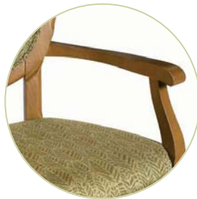
Savannah wood arm with grip extension.