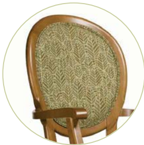
Savannah curved design.

Product shown in Maharam Verse, 002 Bushel with SBM Sandy Beach finish.