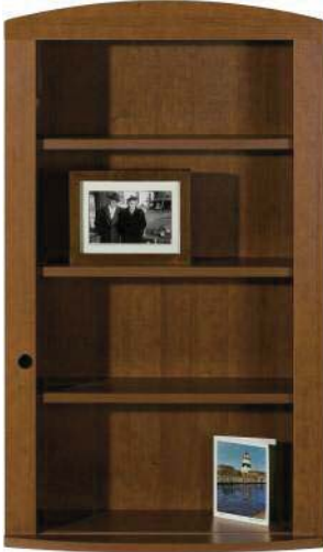
Left hinged (GCLMB01L) Right hinged (GCLMB01R)

The Sonoma Collection memory box provides a safe place for the precious mementos brought from home.