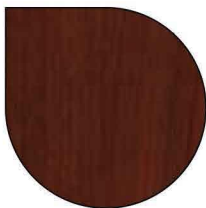
Harvest Cherry (CS)