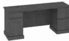
72"W x 24"D Double Pedestal Kneespace Credenza(B/B/F, F/F) 30 \frac{3}{4} "H x 72 \frac{1}{4} "W x 22"D

30 \frac{3}{4} "H x 60 \frac{1}{2} "W x 30"D