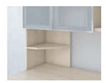
Overhead Cabinets may be supported by Corner Units with shelves (above) or Storage Modules (upper left).

Worksurfaces, Storage Cabinets, Overhead Cabinet with frosted glass doors, Support Modules, Pedestals and Wardrobe Tower in Summer Suede. 3200 Chair in Black fabric.