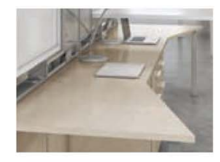
Right- and left-hand Hatchet Worksurfaces provide expanded working space.

e5 is Easy to Afford for even the smallest companies. Because it's also Easy to Reconfigure, adding workers and transforming work environments is a piece of cake. You can repurpose components into entirely new applications and expand office layouts with minimal disruption. Bulk up storage. Diversify function. Add more power, anywhere you want it. Whatever your needs, now and in the future, you can count on e5 for an easy solution.