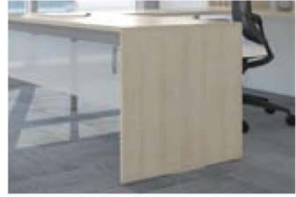
Worksurfaces may be supported by full End Panels in addition to Steel Legs or Pedestals.

A magnetic Tackboard spans between vertical components to display notes, photos and art.