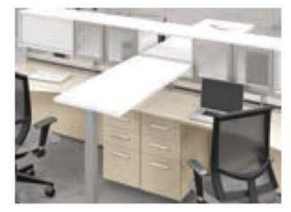
Standing-height Worksurfaces invite collaboration and promote movement.