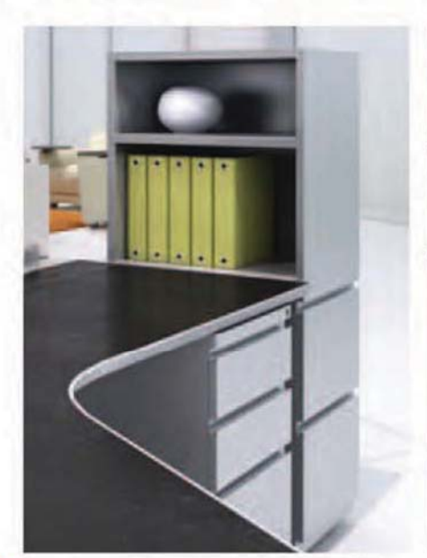
Bookcase Towers incorporate two adjustable shelves and a choice of two pedestal configurations.

Single-Sided Office Work Stations with Desks and Returns in Designer White laminate with Pedestals in W Tackboards in Crosstown Ray fabric. Commute™ Chairs in Expo Latte fabric.