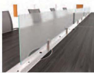
Frosted Acrylic Privacy Screens boast flame-polished edges to give the appearance of glass.