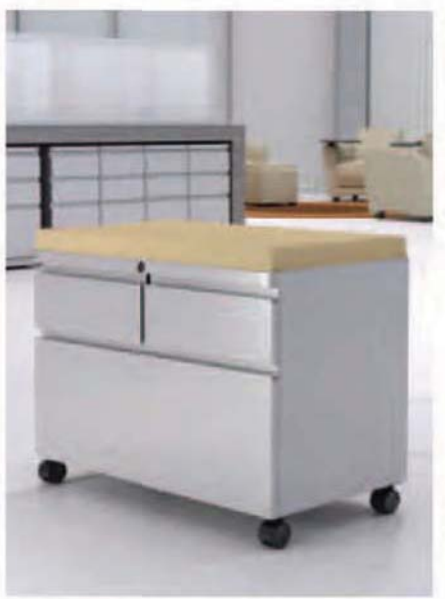
Mobile File Centers with cushions provide lockable storage and serve as casual seating for quick collaborations.