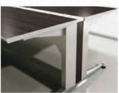
Leg panel inserts match laminate worksurfaces to create a distinctively modern visual motif.