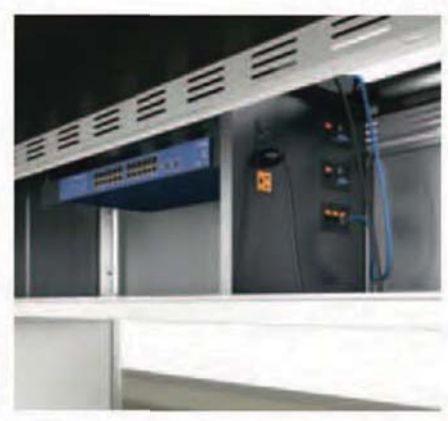
Table troughs can be outfitted with optional rack mount, VGA and custom plate options.

Cords route horizontally through an undersurface trough and vertically within the table leg.