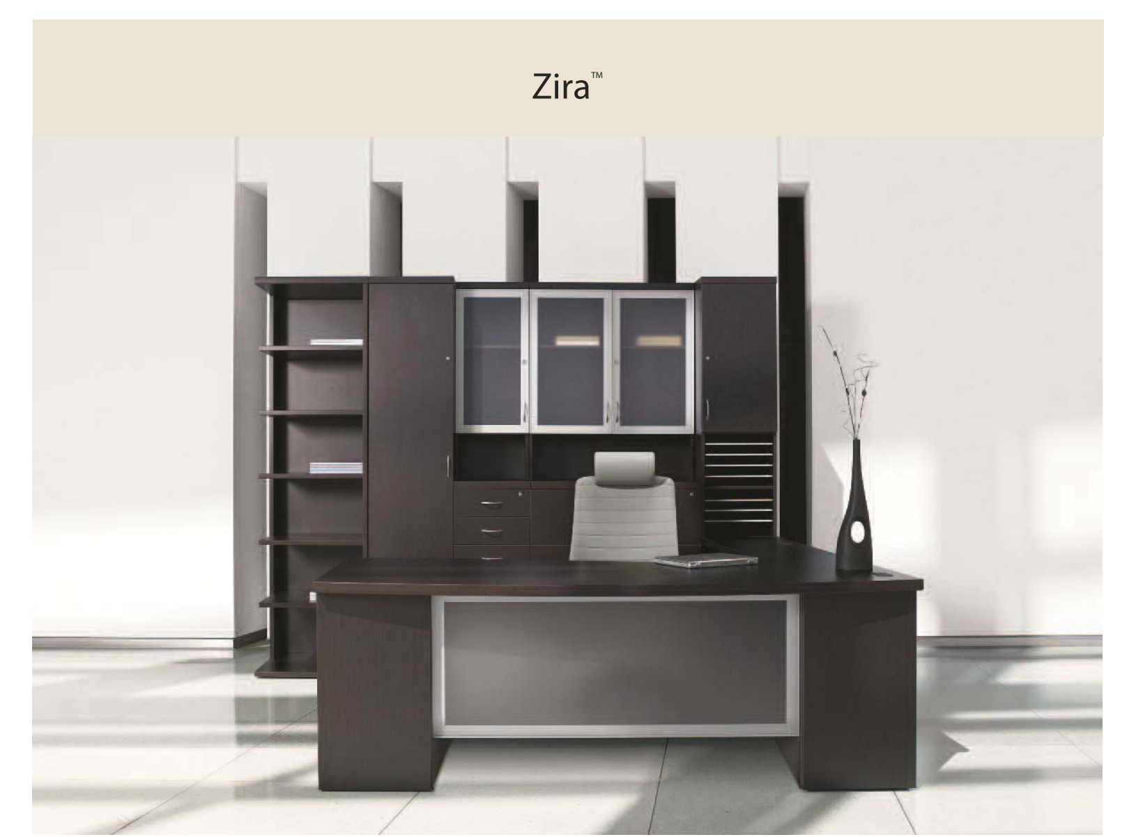
Office desk with hutch

For the managerial application or executive offices, create a work environment that meets your worksurface needs and storage requirements. Select from hundreds of laminate finish combinations, storage components that can tower to 84" high, 9 handle options, 5 different choices for edge details, 4 glazing options on doors and modesty panels and 1" and 1½" thick top options.