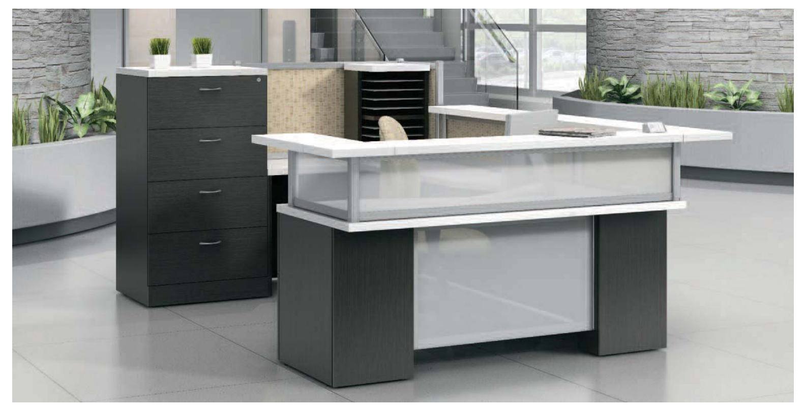
Above: Zira shown in White (WHT) and Dark Espresso (DES).