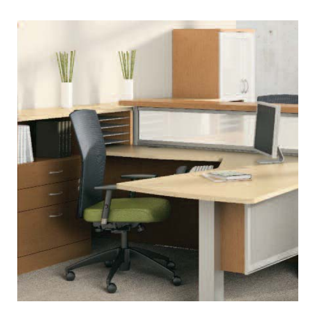
Top left: 4" square monopost are available in Silver or Black finish. Optional 4" and 5" round are available at no extra charge. Top right: Box drawers are mounted on ¾ extension ball bearing slides. Bottom left: Divide™, a modular desk-mounted panel system shown with glazed panels which vertically stack to provide privacy. Bottom right: Hutch with glazed doors are available in 4 glazing options with Silver or Black frames. 9 handle options in Silver, Black, Nickel or Brass finishes.

Zira L shaped office desks shown in Tiger Maple (TMP) / Tiger Fruitwood (TFW) with frosted glazed doors / Silver frames (Z1) and flared Silver HS handles. Alero and Caprice seating shown