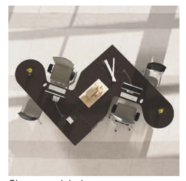
Cherry wood desk

For the managerial application or executive offices, create a work environment that meets your worksurface needs and storage requirements. Select from hundreds of laminate finish combinations, storage components that can tower to 84" high, 9 handle options, 5 different choices for edge details, 4 glazing options on doors and modesty panels and 1" and 1½" thick top options.