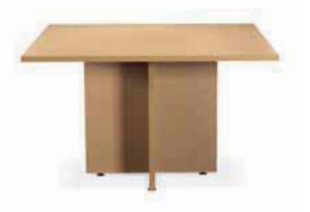
Square table with matching T-molding and X-base shown in Constellation Latte CSL