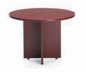
Round table with matching T-molding and X base shown in Avant Cherry AWC.