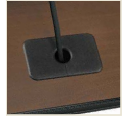
Optional wire grommets can be ordered 'factory installed'.

Thumbscrews provide easy ganging for two or three way connections. Swings away when not in use.