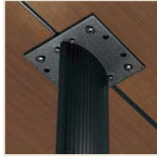
Steel to steel fastening

Protects both the table edge and the surrounding environment. ConnecTABLES edge is unique to the series.