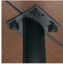
Thumbscrews - CNTS

Durable steel-to-steel fastening ensures a secure connection for both linking and freestanding positions.