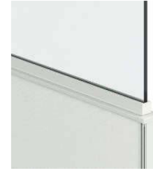
Surface Mount Channel Screen on Panel